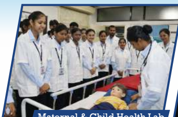
Maternal & Child Health Lab