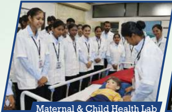
Maternal & Child Health Lab